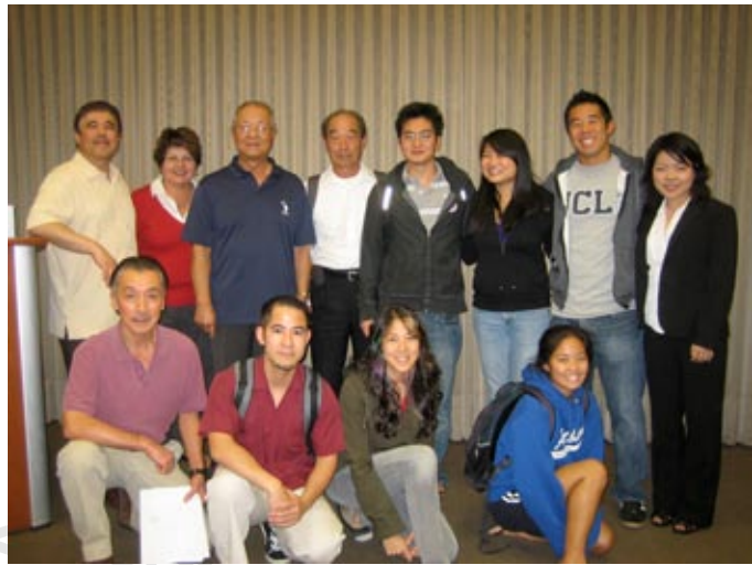
Volunteers from the Nov UCLA event